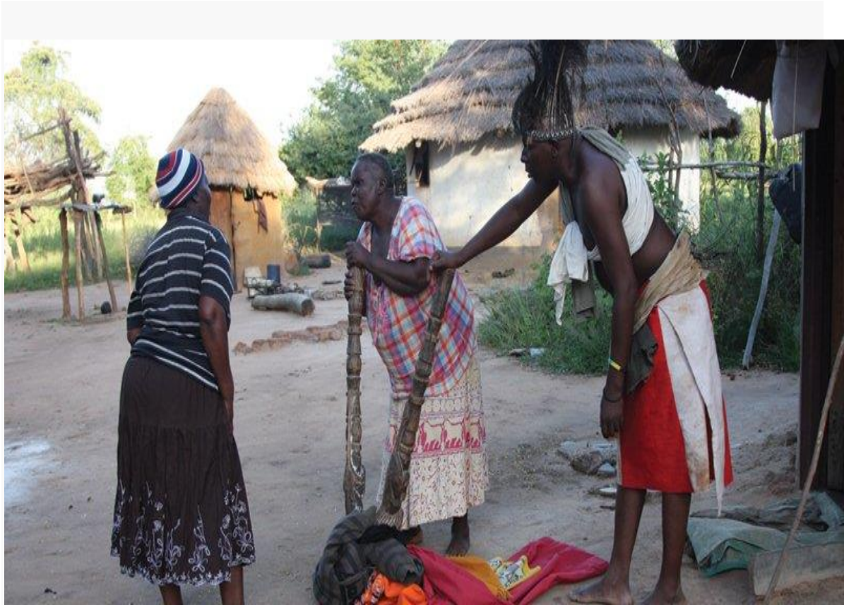
Figure 4 The two tsikamutanda asking an old person to confess her witchcraft.